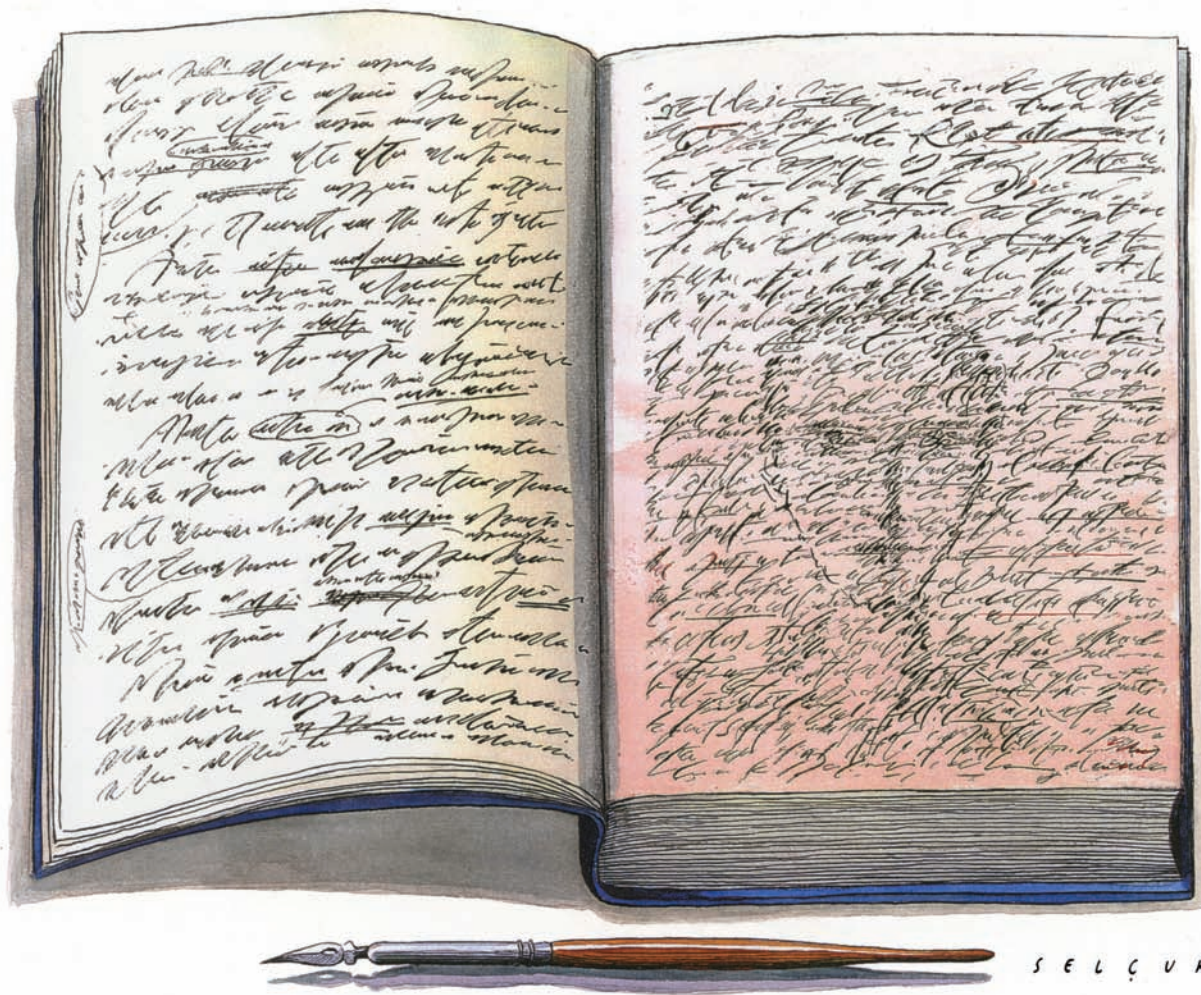
Illustration: Selcuk Demirel/martenaagency.com